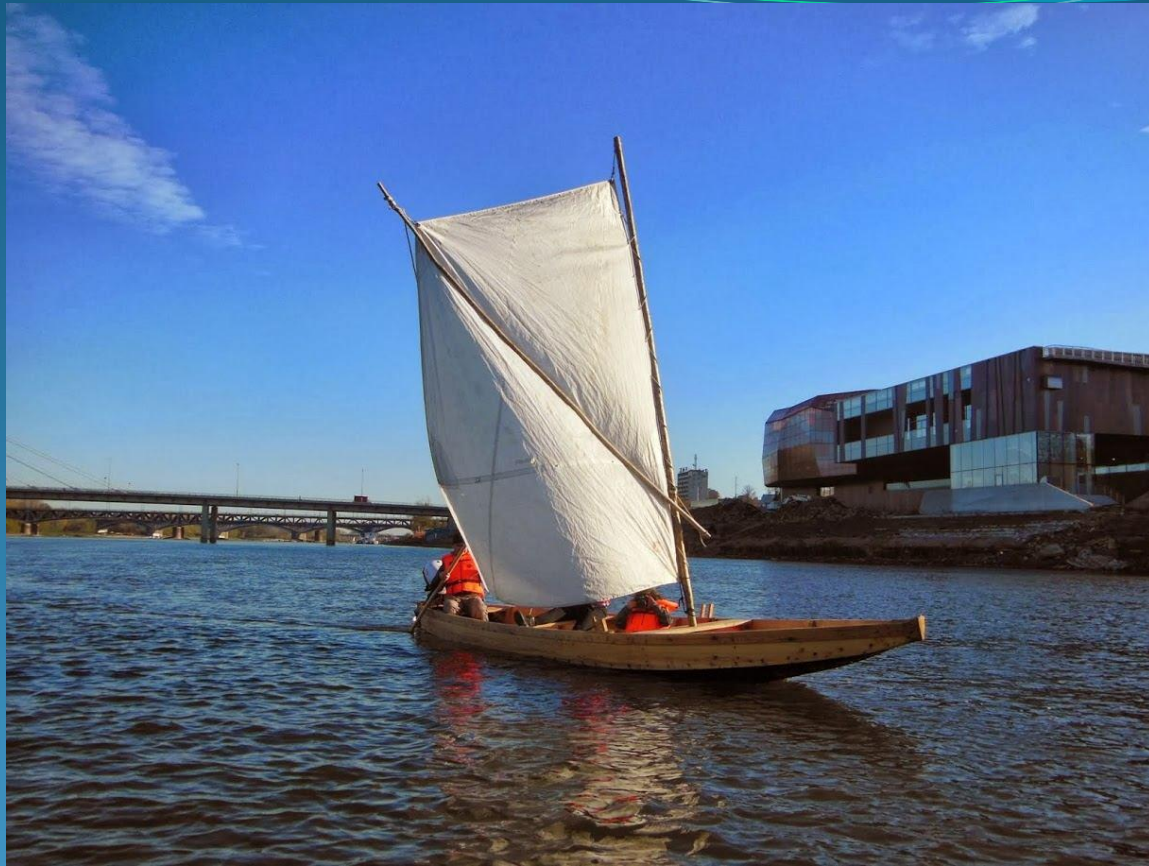
Replica of Vistula working boat, Warsaw, 2013