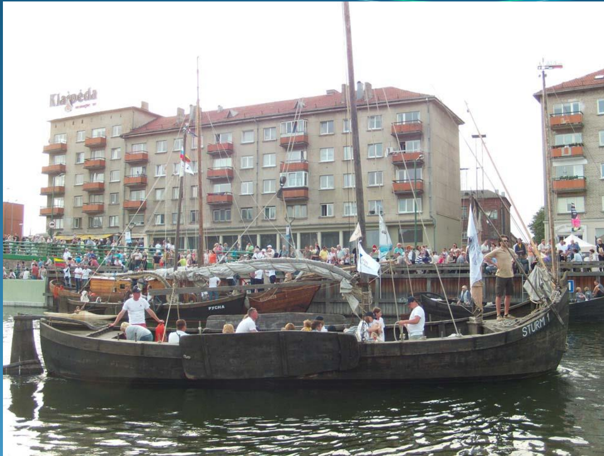
Kurena at the Klaipeda Sea Festival