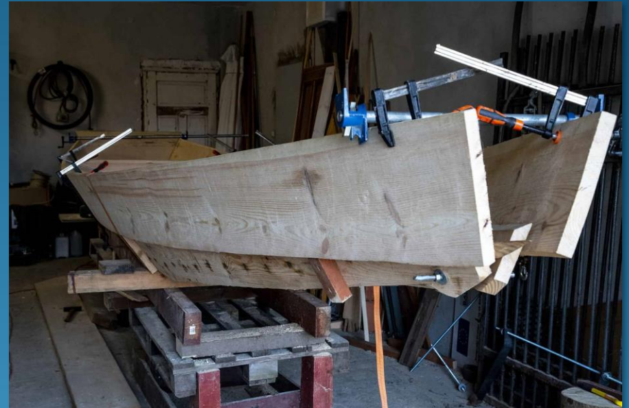
1st Boatbuilding Workshop in Sandomierz, 2019