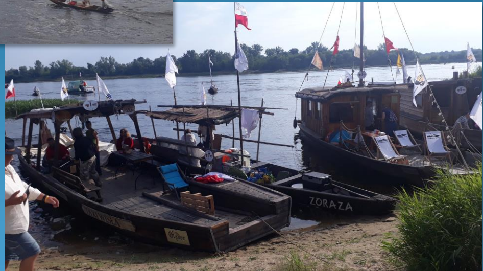
Vistula Festival in Torun