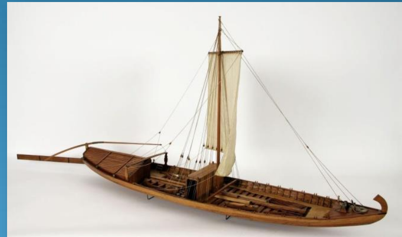
Models of popular floating Vistula ships from 16th-18th centuries