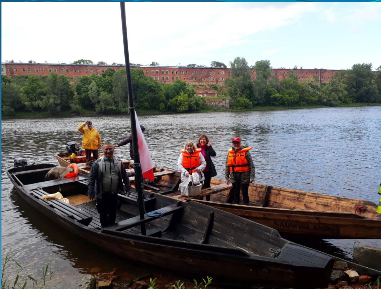
Foreground: private boat "Śpiewiatru" with his owner on-board, background - boat "Nadwiślanin" belonging to Enjoy Leoncin Association founded in 2017, Modlin, 2021