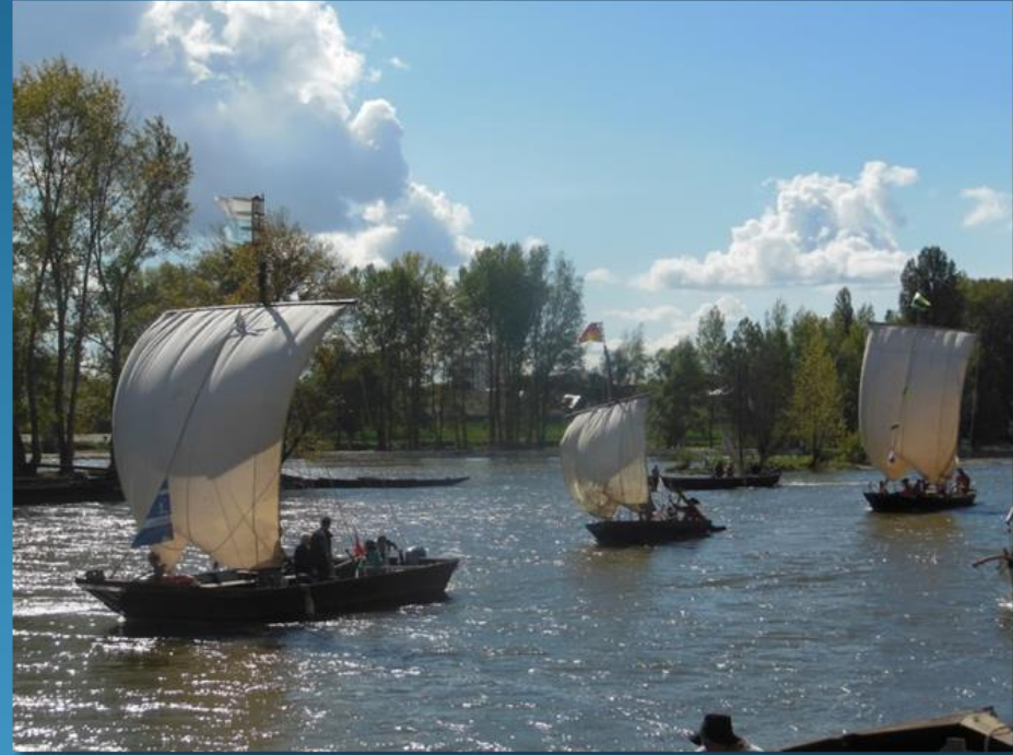
Orléans Loire Festival, 2015