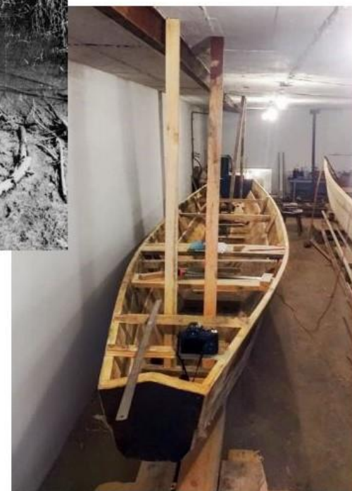
26. Dla porównania jej replika w trakcie ostatniego etapu budowy.

Publication describing construction of a boat replica from Ernst Stoyk's workshop in Silno near Toruń