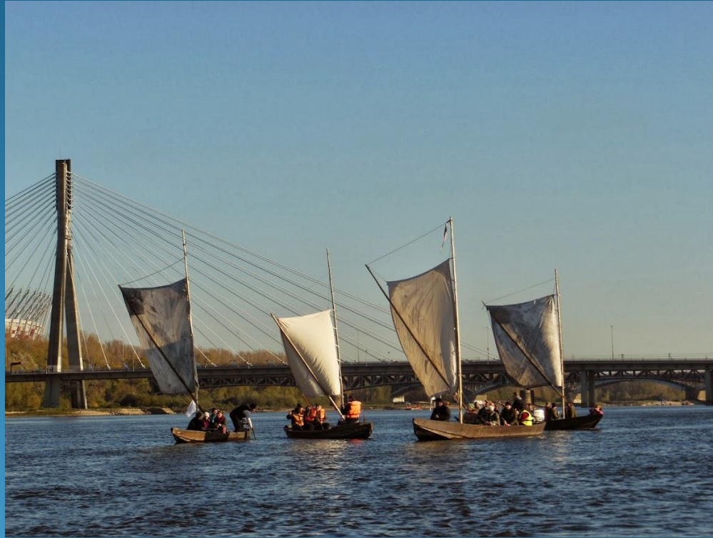
Jadwiga Klim National Maritime Museum in Gdansk