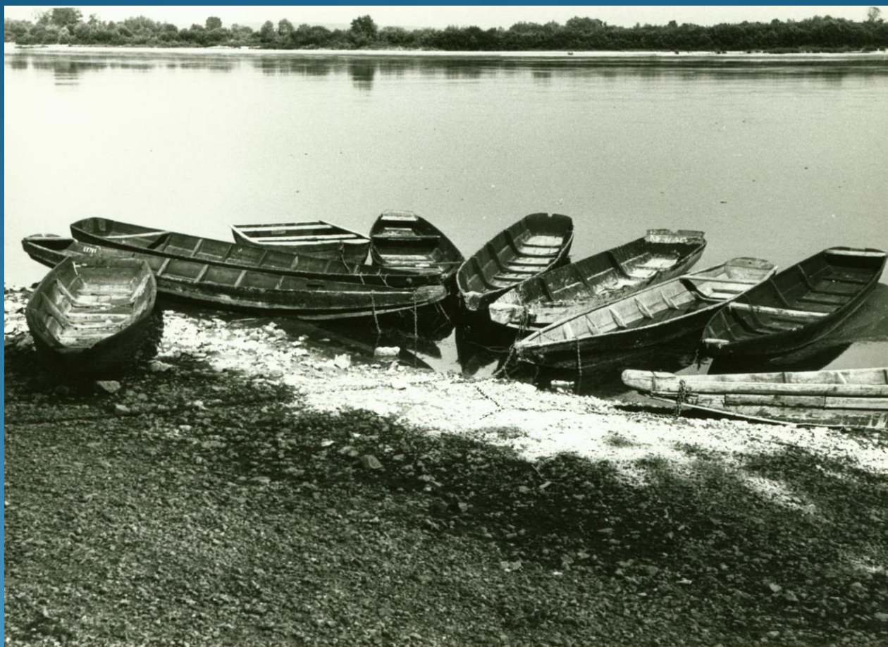
Working boats from Zawichost on Vistula River, 1979