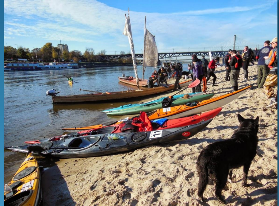
Party on Vistula Island in Warsaw, 2013