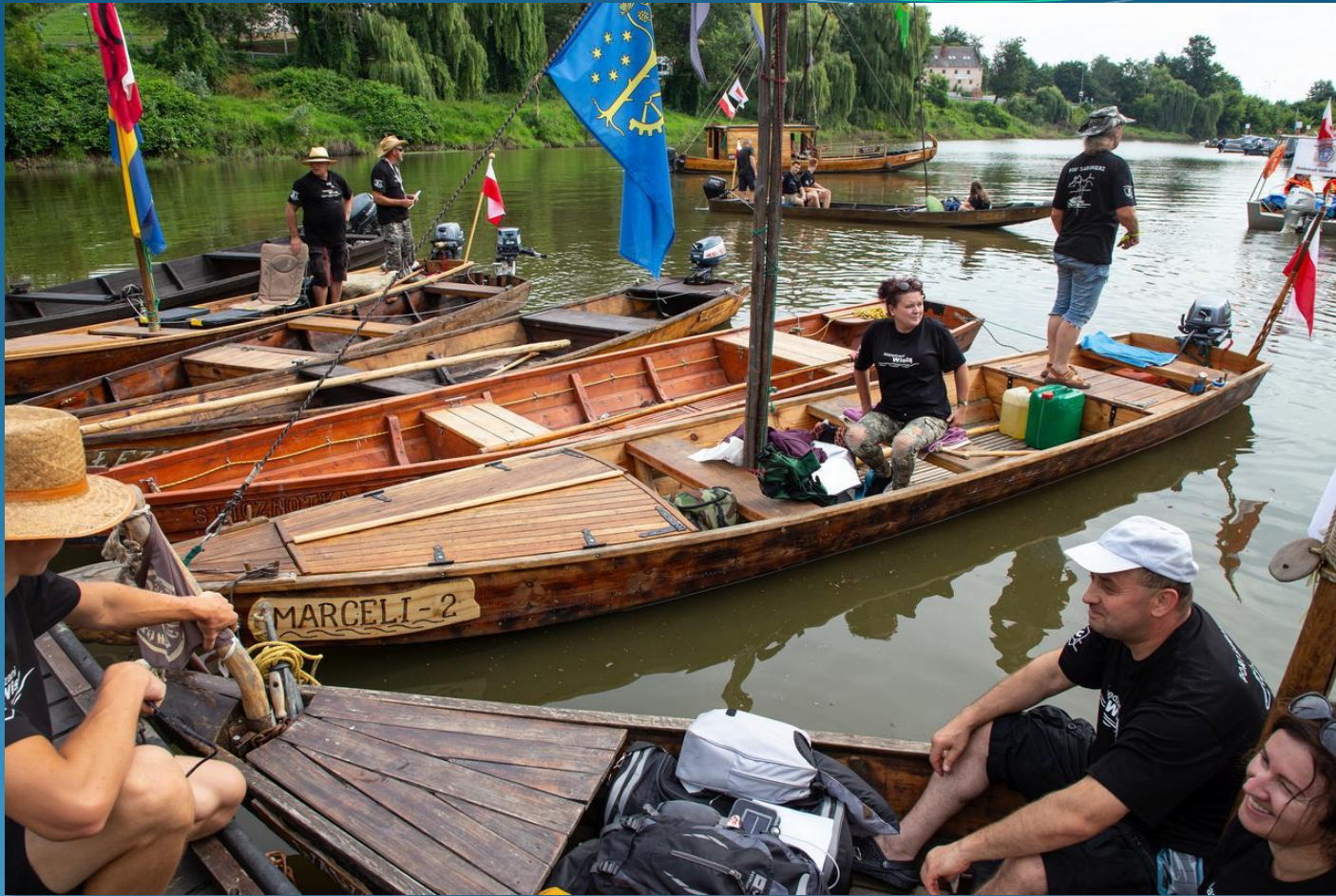
Boats of "Powered by the Vistula" during the 5th Warsaw Expedition, 2020