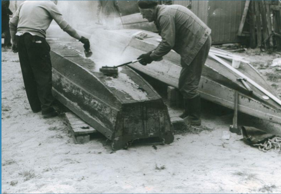
Experienced boat-builders from Nowy Dwór Mazowiecki in 1980