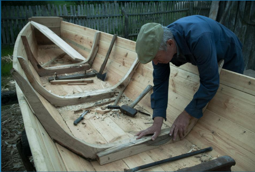
Experienced boat-builders from Nowy Dwór Mazowiecki in 2014 and Wieluń in 2023