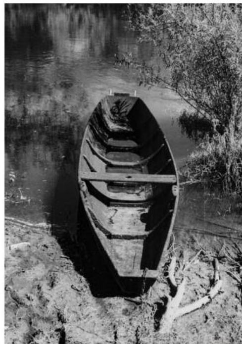
25. Łódź pomorska z warsztatu E. Stoyke, Złotoria, 1996 r.