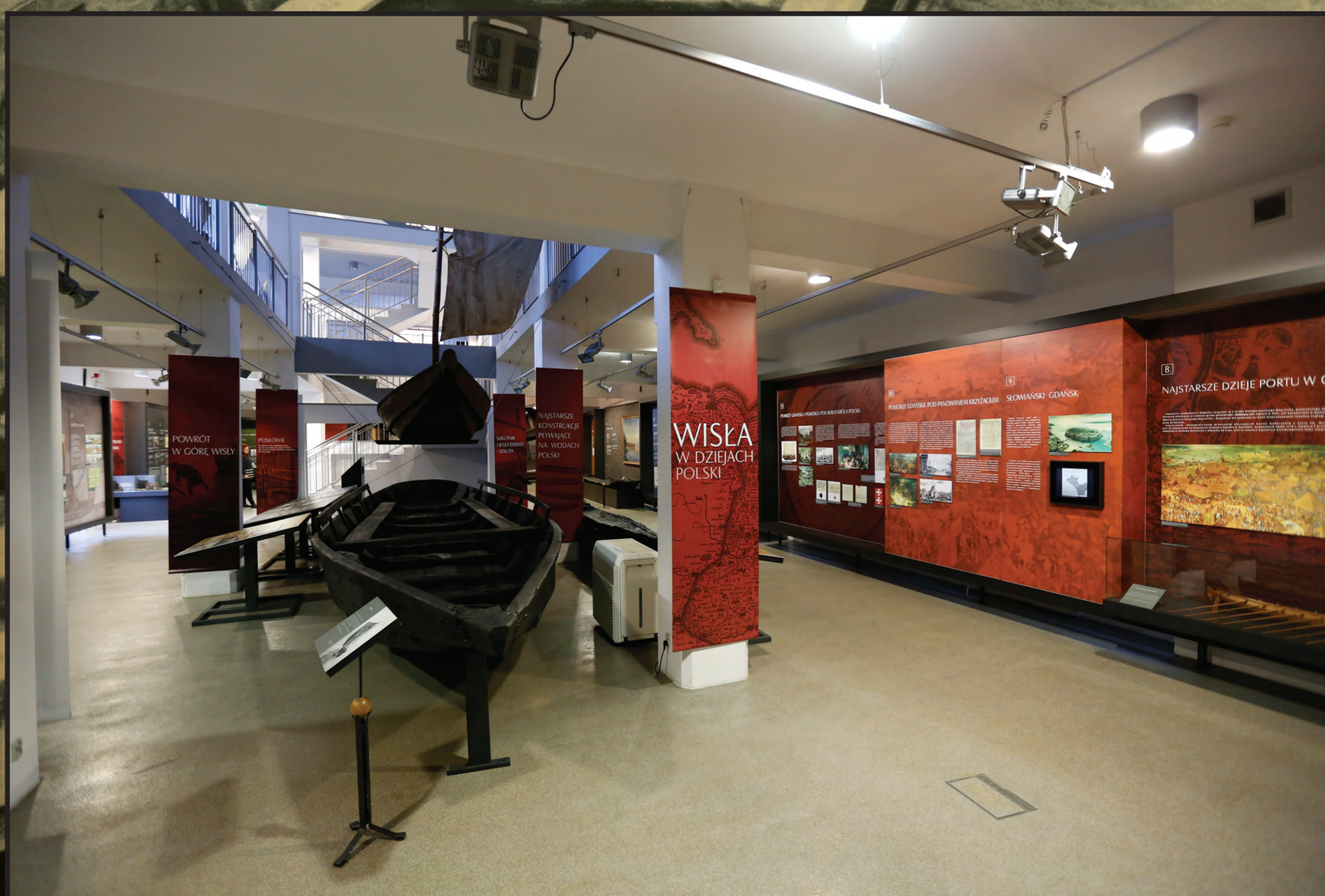
Bat from Kazimierz Dolny at the permanent exhibition "Vistula in the history of Poland" at the Vistula River Museum in Tczew - Branch of the National Maritime Museum in Gdańsk photo by Piotr Zagiell, 2017